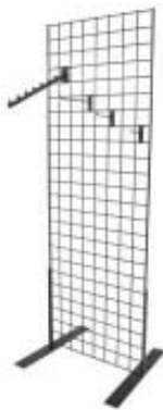
Grid Panel w/Feet (hardware not included)